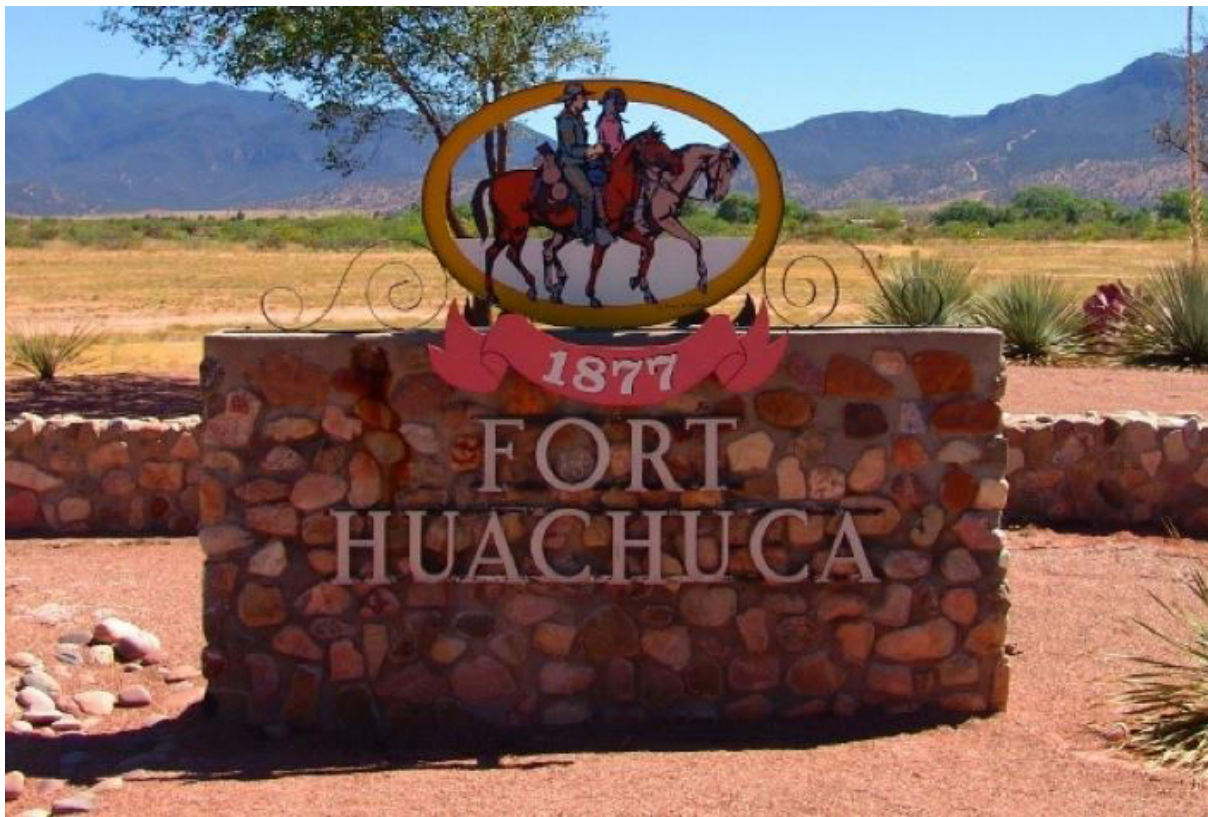
Fort Huachuca in Arizona, military base of the US Cyber Command THE EX 007: «TARRANT, A JEW TRAINED TO KILL ASSAD»

Command at Fort Huachuca in Arizona after they ignored a warning letter the Department of Homeland Security of the White House following the detailed report on a fake chemical attack in Syria , built by Al Nusra, White Helmets and the Turkish military to blame Assad's army (see link at the end of the article).