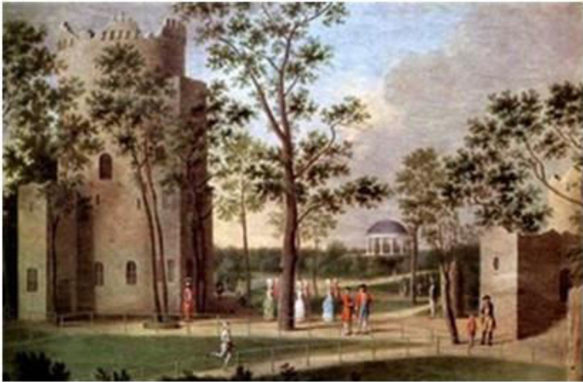
Mayer Amschel Rothschild's Wilhelmsbad Castle took place at the Masonic Congress in 1772