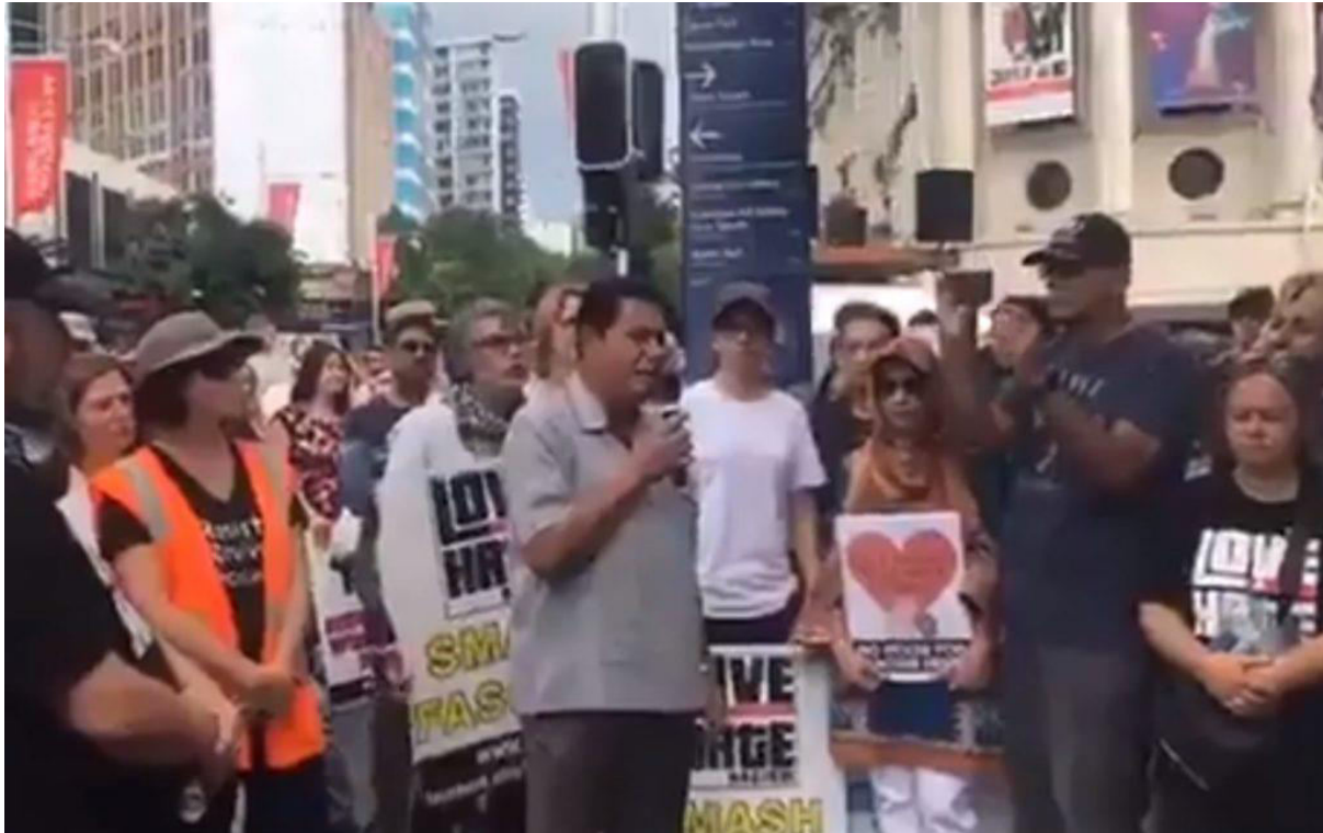
Former Fijian deputy now president of Auckland's most important mosque during his speech – CLICK ON THE IMAGE FOR THE VIDEO