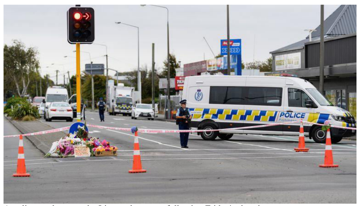
A police cordon near the Linwood mosque following Friday's shootings