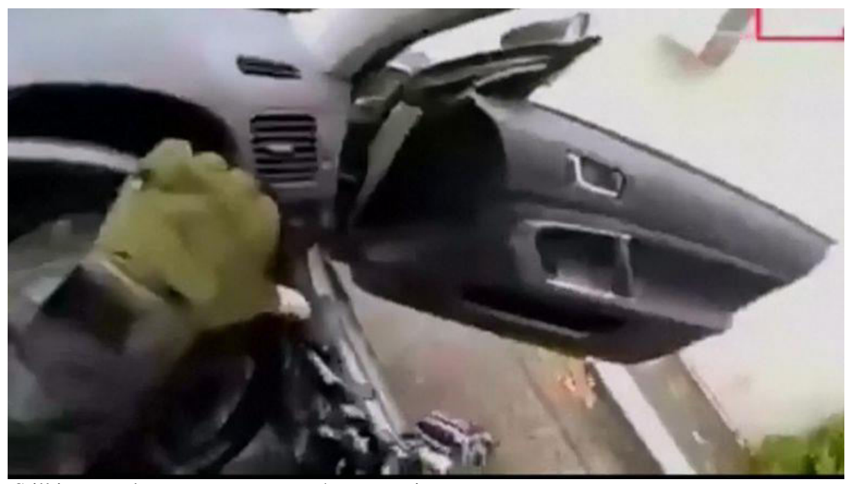
Still images show mosque gunman's preparation

He added: "I had the shotgun in my hands. Then I saw he dropped his gun and he ran and I chased him."