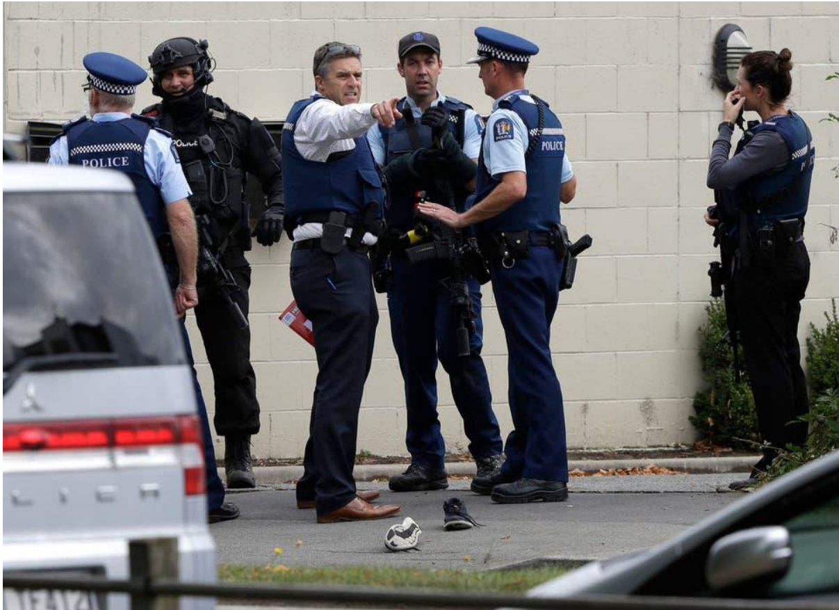
Police stand outside a mosque in central Christchurch, New Zealand.