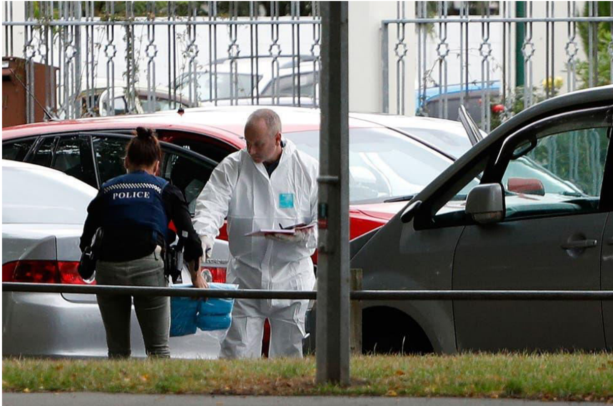
A forensic official works at the Masjid al Noor mosque in Christchurch